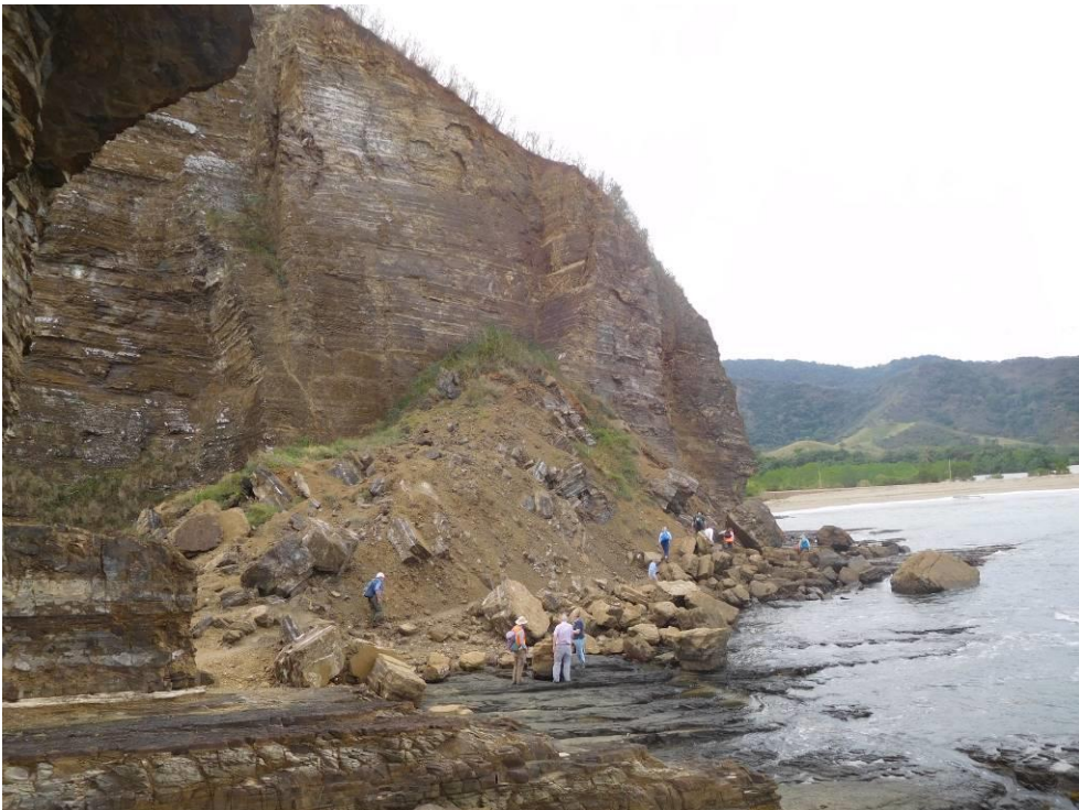
Eocene Flysch, Roche Percee, near Bourail.