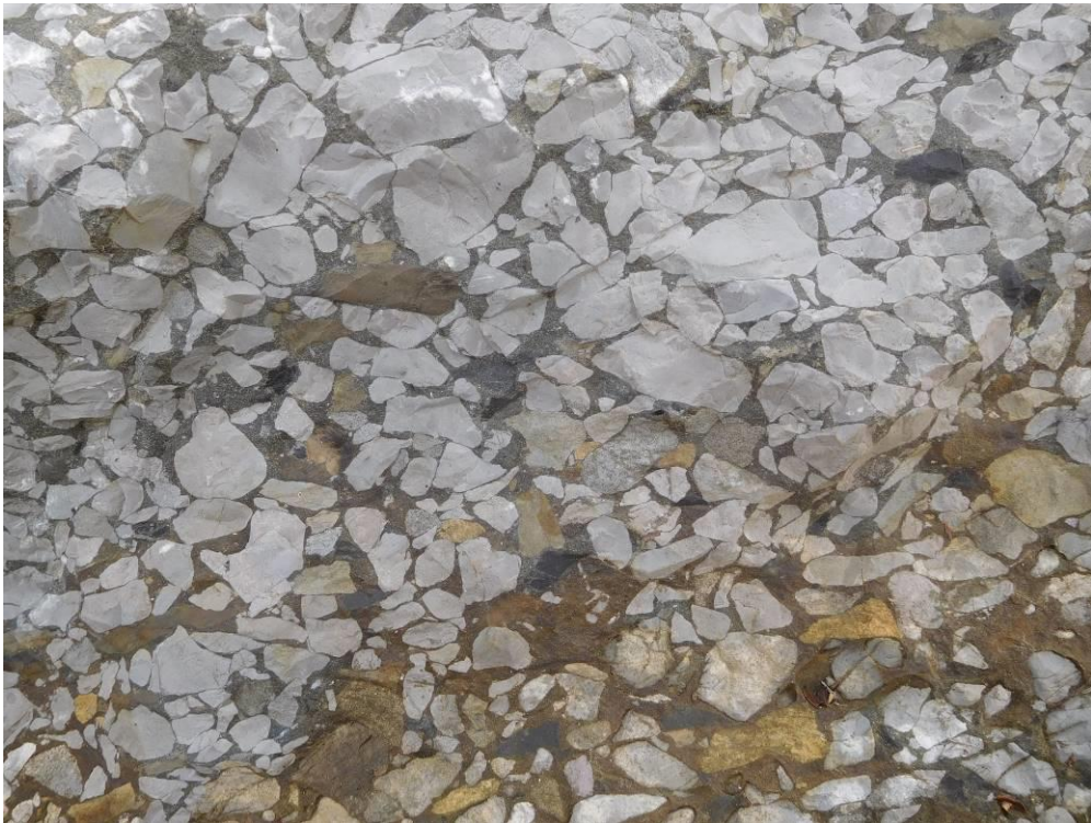
Spectacular Early Eocene limestone breccia (Montagnes Blanches Unit), near Bourail, west coast New Caledonia.