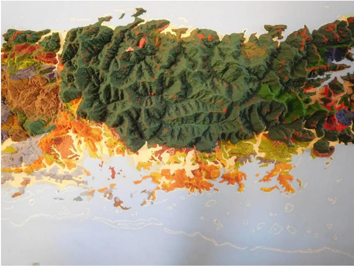
A 3D model showing the geology of southern New Caledonia with the Massif de Sud (Peridotite Nappe) in green. This display has pride of place in the Geological Survey of New Caledonia (SGNC: Service Geologique de Nouvelle Calédonie) in Noumea.