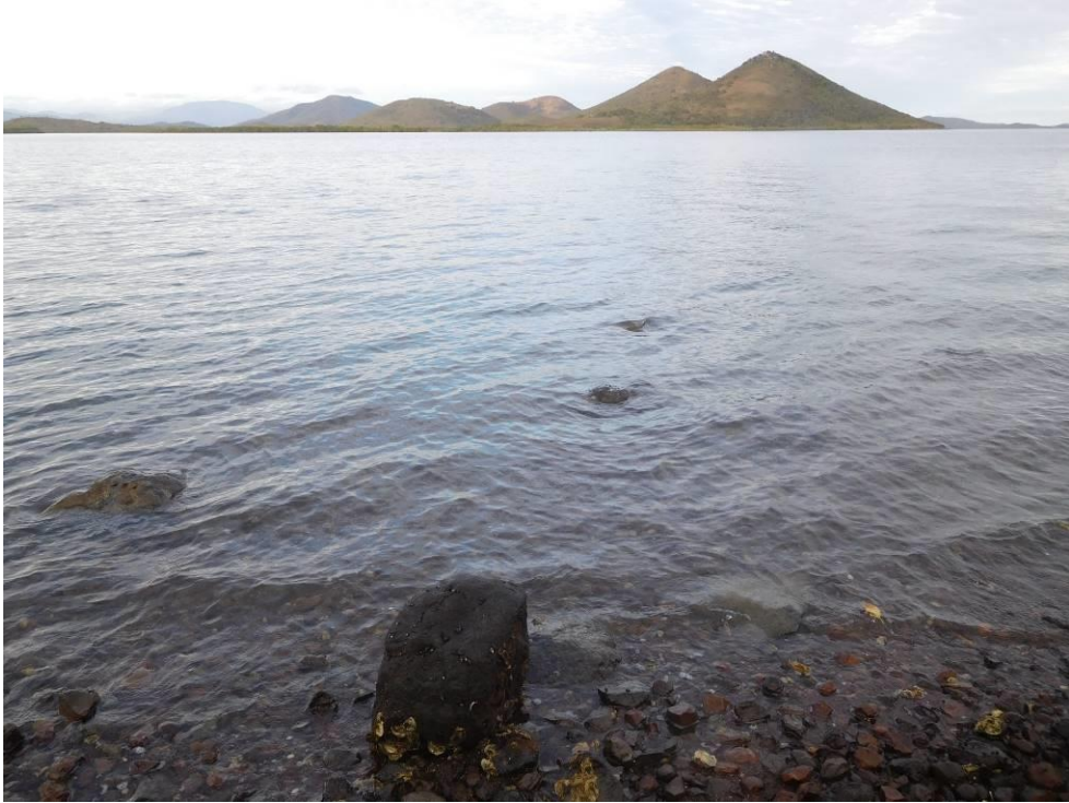
Looking SE across the Baie de Teremba at some of the oldest rocks in New Caledonia: Permian volcaniclastic rocks, Teremba Terrane.