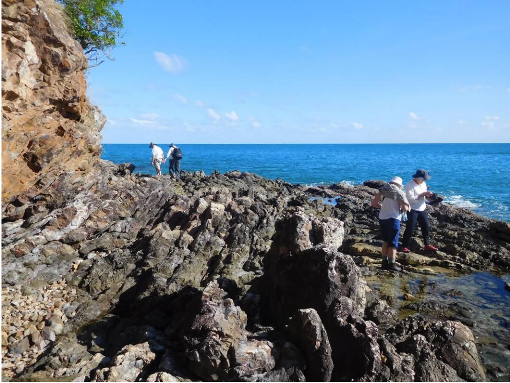
Folded rocks of Late Cretaceous age (Black Chert Formation), Presqu'île Nouvelle, Noumea.